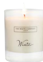
Winter Signature Candle £22