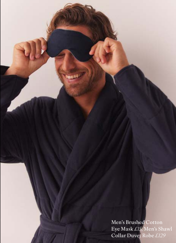
Men's Brushed Cotton Eye Mask £15, Men's Shawl Collar Duvet Robe £129