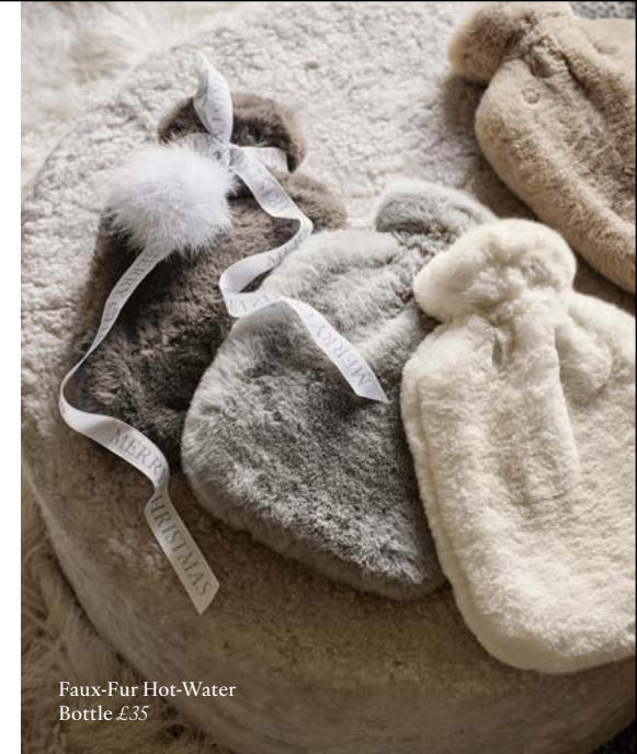
Faux-Fur Hot-Water Bottle £35