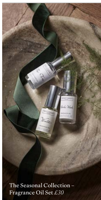
The Seasonal Collection – Fragrance Oil Set £30