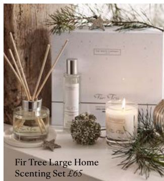
Fir Tree Large Home Scenting Set £65