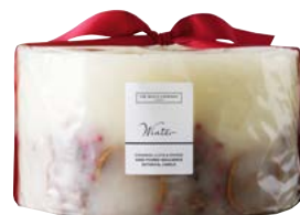
Winter Indulgence Botanical Candle £95