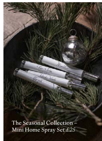
The Seasonal Collection – Mini Home Spray Set £25