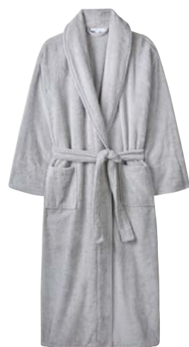
Unisex Cotton Classic Robe £65