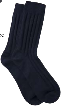
Men's Cashmere Bed Socks £36