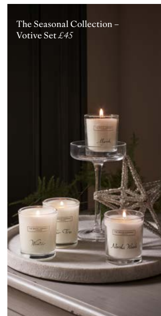
The Seasonal Collection – Votive Set £45

Seasonal collections with mini sizes (all the better for trying more scents). Boxed and gift-ready. And, of course, electronic diffusers to gently fragrance the air.