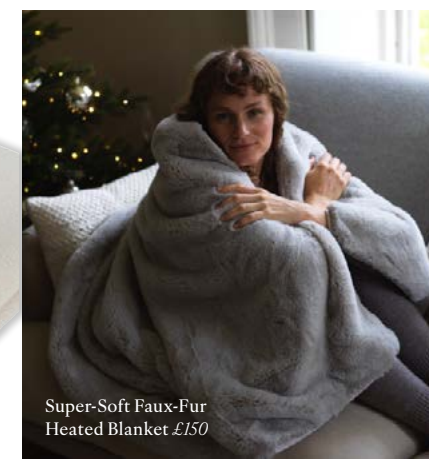
Super-Soft Faux-Fur Heated Blanket £150