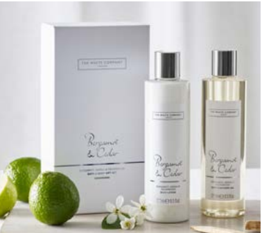
Bergamot & Cedar Bath & Body Gift Set £28