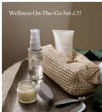
Wellness On-The-Go Set £35