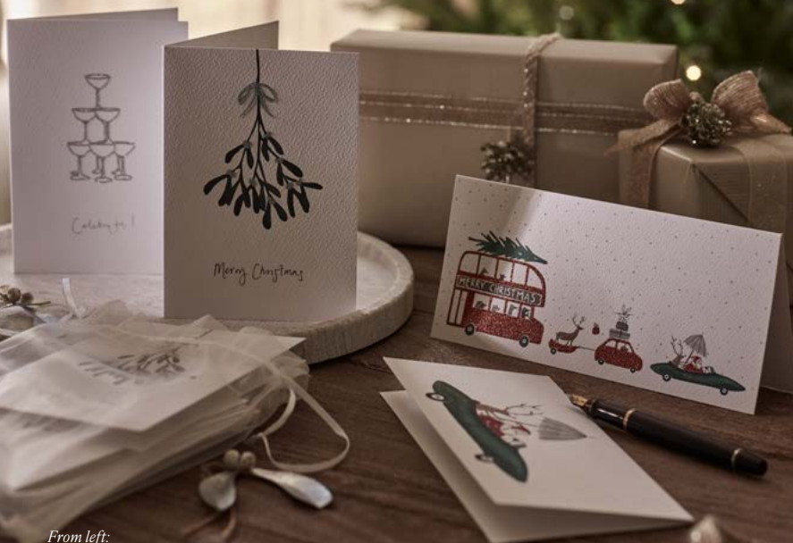
From left: The White Company Charity Christmas Cards – Set of 12 £12, Snow Scene Charity Christmas Cards – Set of 12 £12

2 Television Centre, 101 Wood Lane, London W12 7FR @thewhitecompany thewhitecompany.com