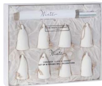
Winter Ceramic Bells with Spray – Set of 8 £20

That familiar scent of zesty oranges. Infused with warming cloves and spicy cinnamon. Candles. Diffusers. Decorations – and a generously filled hamper, including new-for-this-year bath and body treats.