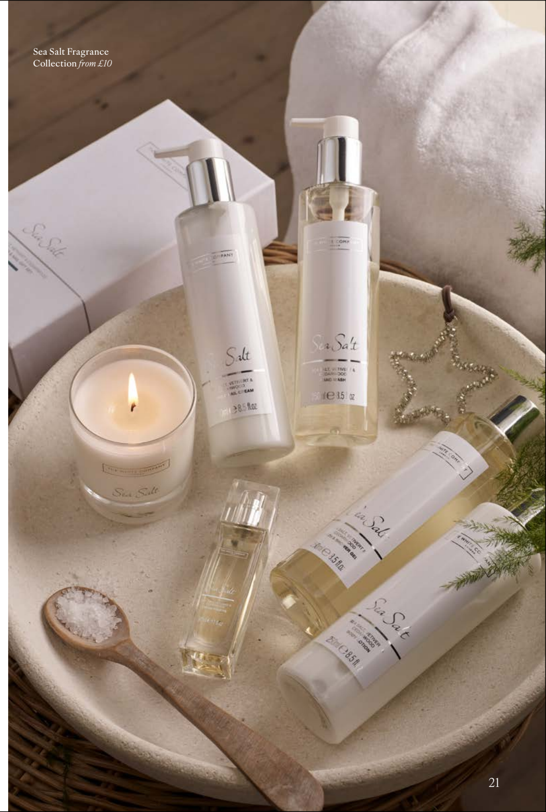
Sea Salt Fragrance Collection from £10