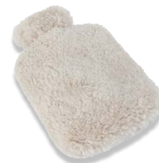
Curly Sheepskin Hot-Water Bottle £65