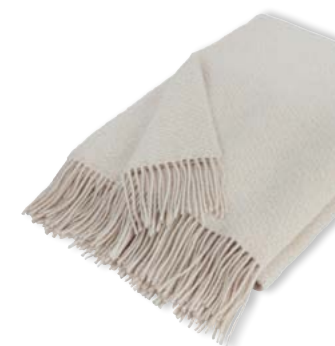
Chepstow Throw £265