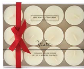
Winter Tealights – Set of 12 £18