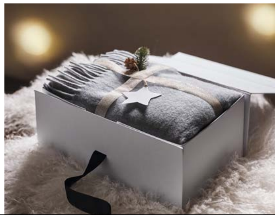
Pure Cashmere Throw £365