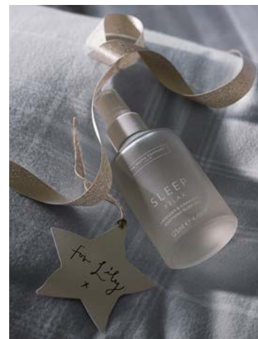
Sleep Soothing Pillow Mist £22