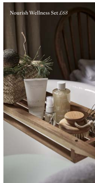
Nourish Wellness Set £68