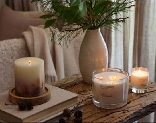
From left: Pomegranate Botanical Candle – Medium £35, Fireside Large Candle £65, Oakmoss Signature Candle £22

Soft cotton. Cosy cashmere. Bathroom favourites. Tokens of appreciation designed with making me-time a priority.