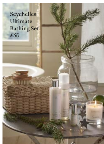
Seychelles Ultimate Bathing Set £50