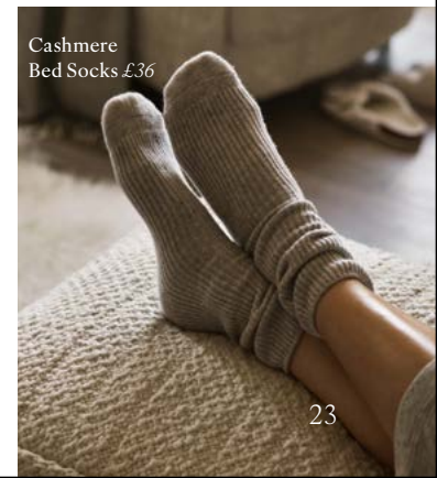
Cashmere Bed Socks £36