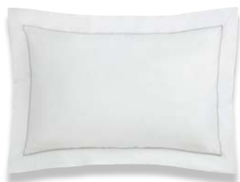
Savoy Bed-Linen Collection Oxford Pillowcase from £28