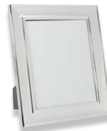
Silver-Plated Photo Frame – 8x10" £75