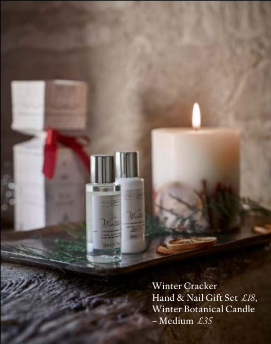
Winter Cracker Hand & Nail Gift Set £18, Winter Botanical Candle – Medium £35