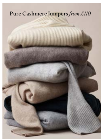
Pure Cashmere Jumpers from £110