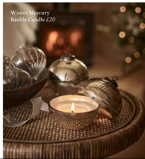
Winter Mercury Bauble Candle £20

Contains: Signature Candle, Diffuser, Botanical Candle Hand Wash, Hand & Nail Cream, Finely Milled Soap, Ceramic Candle Plate, Wickless Hamper