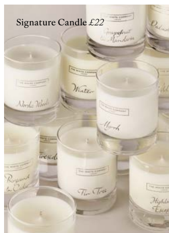
Signature Candle £22