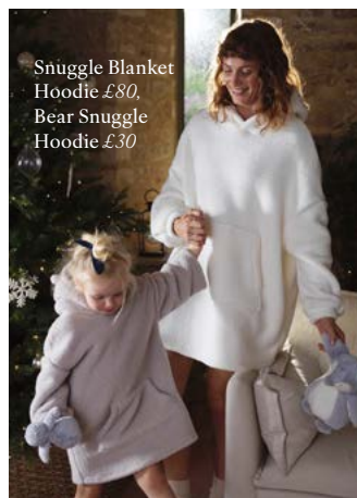
Snuggle Blanket Hoodie £80, Bear Snuggle Hoodie £30