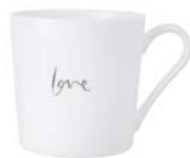
Love Mug £15