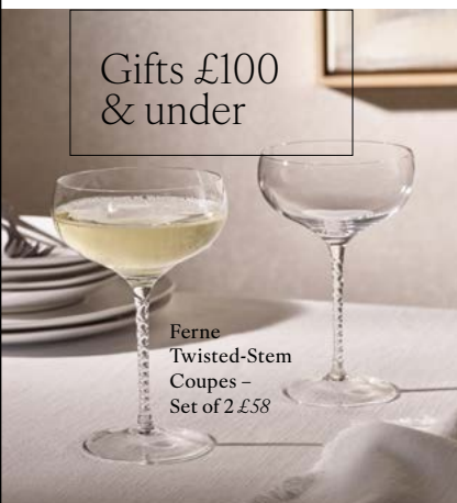
Ferne Twisted-Stem Coupes – Set of 2 £58