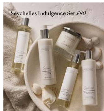
Seychelles Indulgence Set £80