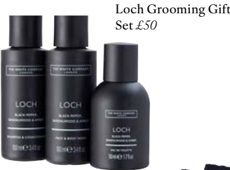
Loch Grooming Gift Set £50