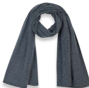
Brushed Cashmere Scarf £149