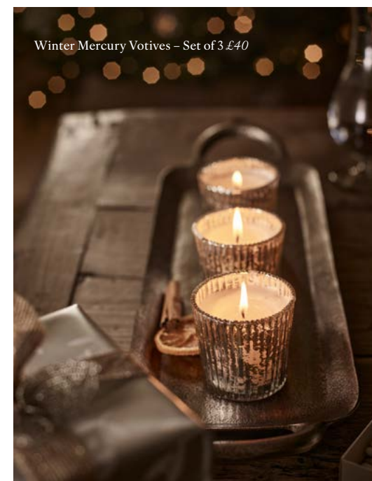
Winter Mercury Votives – Set of 3 £40

One of our most iconic scents needs no introduction. Why not gift Winter?