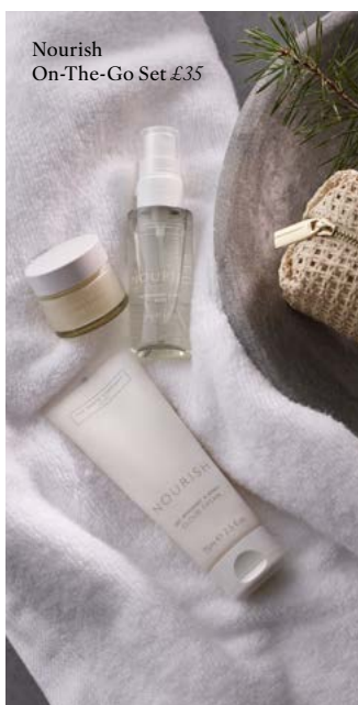
Nourish On-The-Go Set £35

Little thank yous Hits of happiness wrapped up in giftable sets. Who wouldn't want the gift of a little me-time?