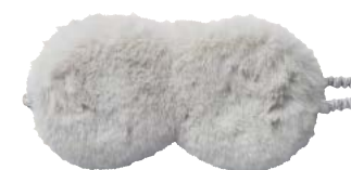
Fluffy Eye Mask £15