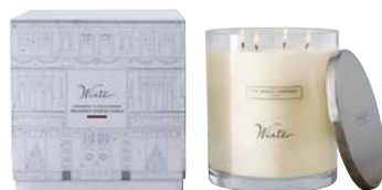
Winter Signature Candle £22