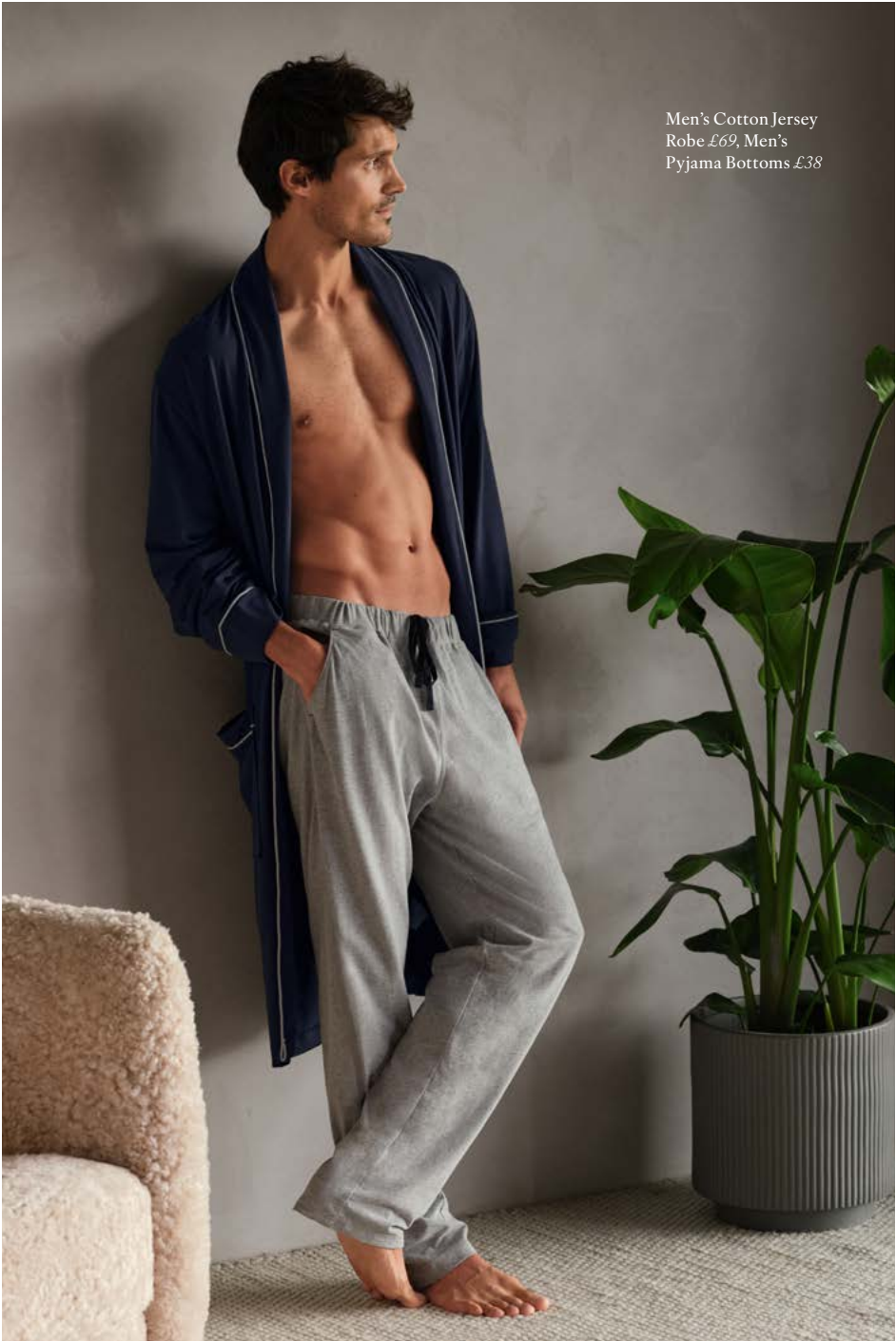
Men's Cotton Jersey Robe £69, Men's Pyjama Bottoms £38