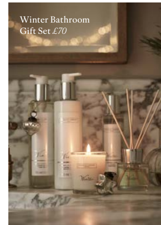
Winter Bathroom Gift Set £70