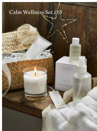
Calm Wellness Set £65