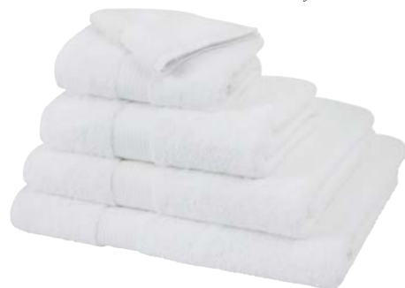
Luxury Egyptian Cotton Towel Collection from £5