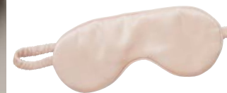
Piped Silk Eye Mask £25