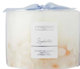
Seychelles Botanical Candle – Large £45