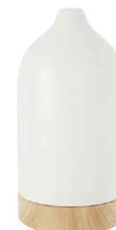
Electronic Diffuser £70