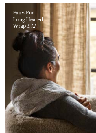
Faux-Fur Long Heated Wrap £42