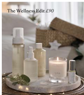
The Wellness Edit £90