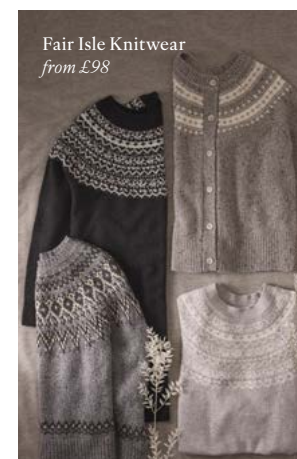
Fair Isle Knitwear from £98