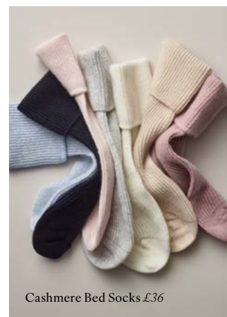
Cashmere Bed Socks £36