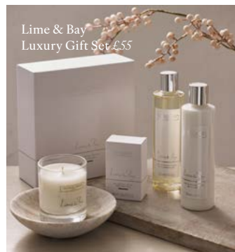
Lime & Bay Luxury Gift Set £55