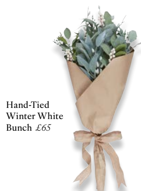
Hand-Tied Winter White Bunch £65