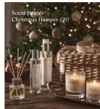
Scent Stories Christmas Hamper £80