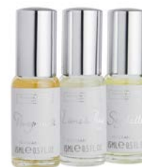
Signature Fragrance Oil Set £30

Combine pieces from our collection for a personalised present in one of our signature white gift boxes – just £5 per box.