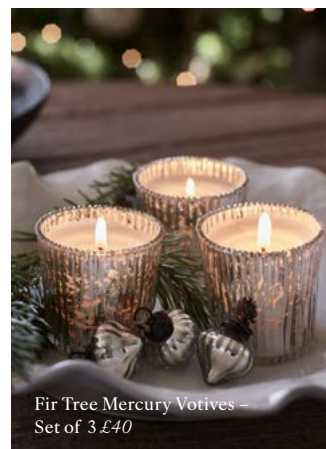
Fir Tree Mercury Votives – Set of 3 £40